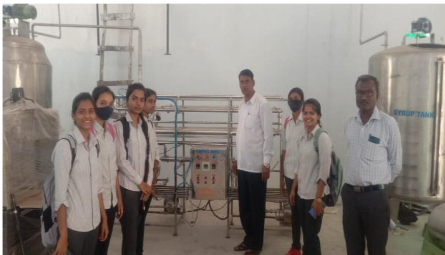
Orange juice plant at Sreetaal synoty agro Pvt. Limited and Universal agro Ltd. Kalmeshwar.