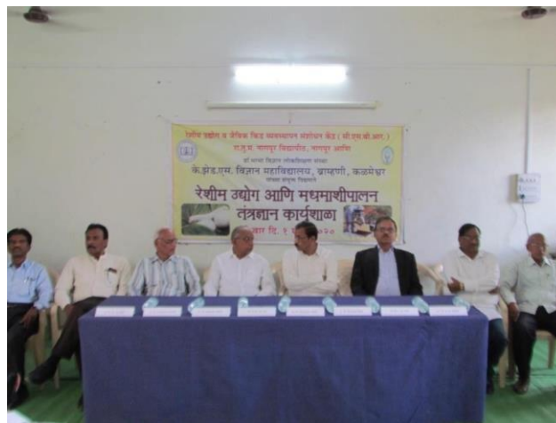
The guests are addressing the gathering in a workshop