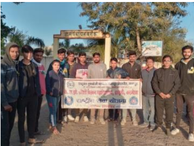
NSS Special Shibir