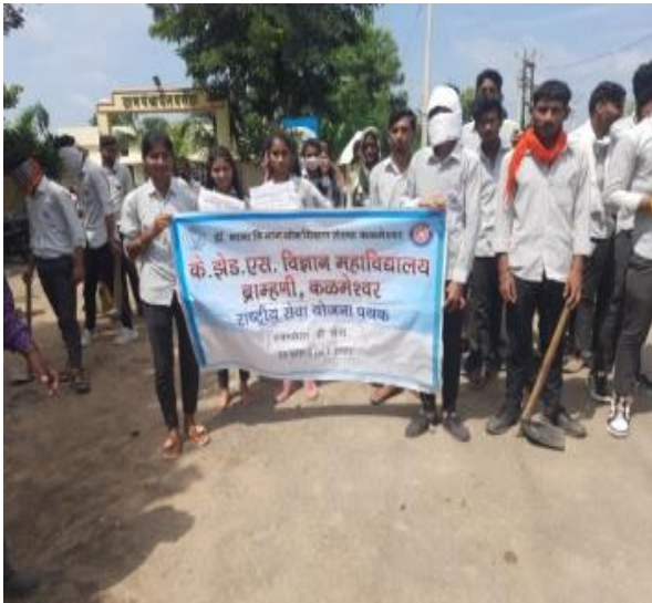
Gram Swachhata Abhiyan at Waroda Village