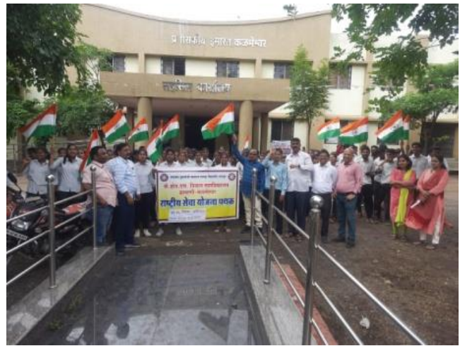
Harghar Tiranga rally by the College students and staff