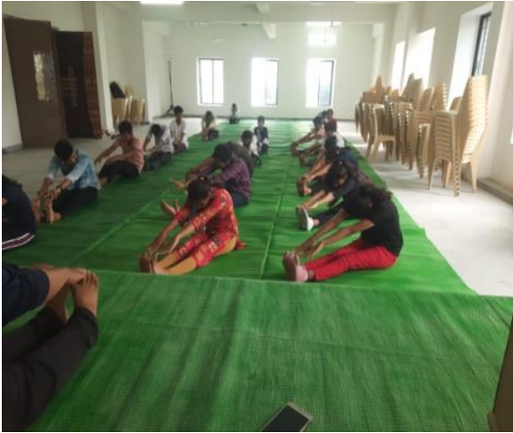
Practical of Yoga by students and Teachers