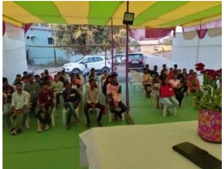
NSS Camp At Waroda Village