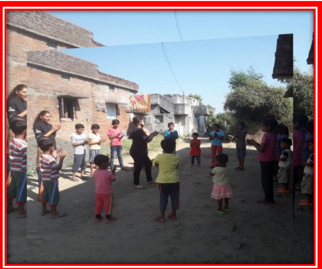
Inspiration to the rural students by College students