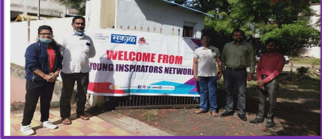
Participation of College students in "YIN" program organized by Sakal Newspaper group