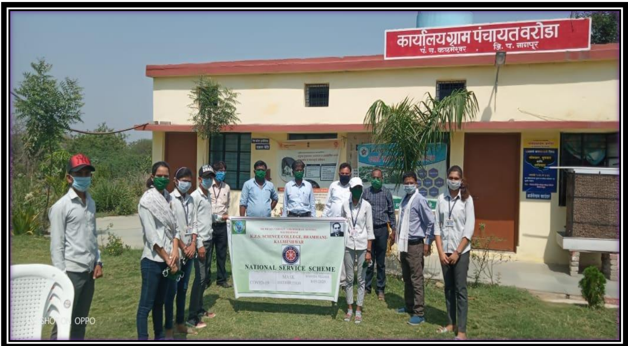
Distribution of Mask by College students and staff during COVID Pandemic at Waroda Village