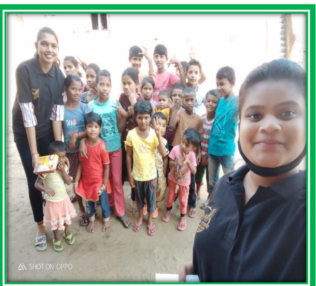
Distribution of SWEETS by College students on the occasion of Diwali 2020