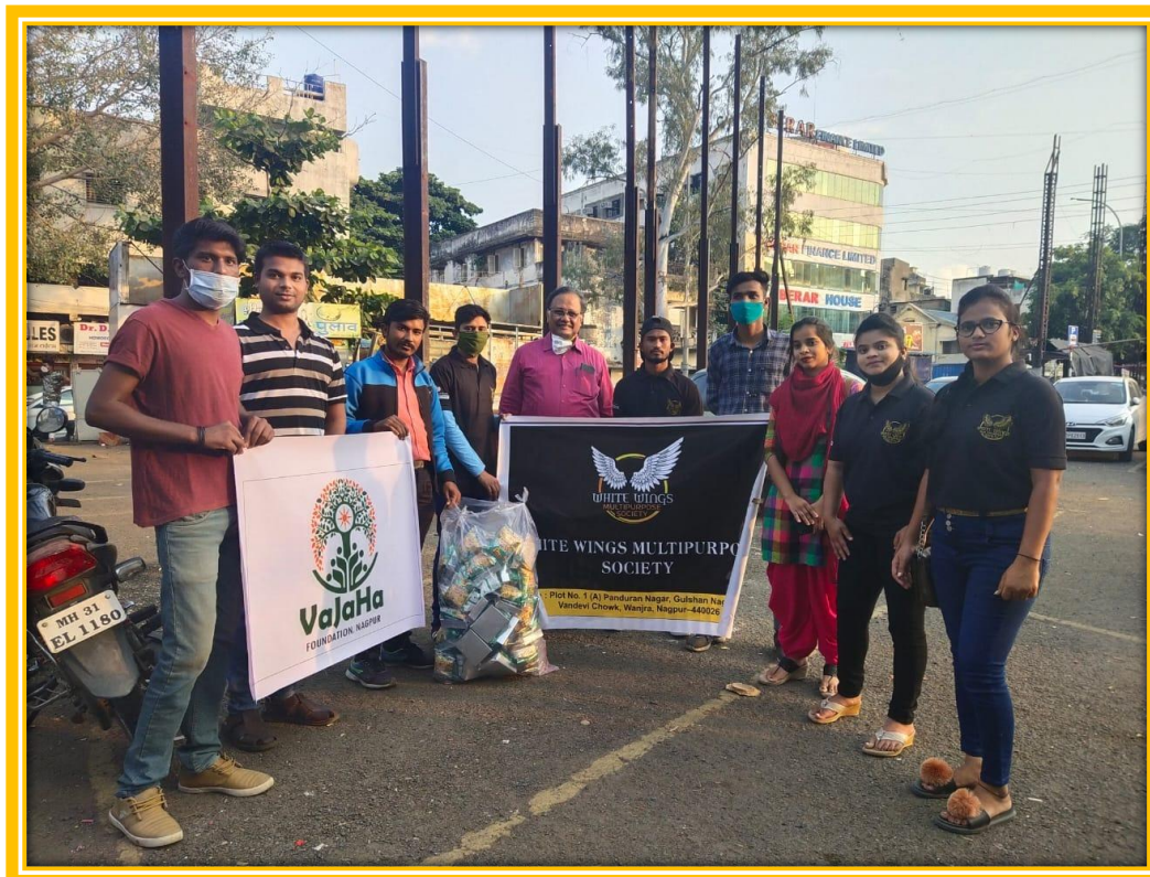
Participation of College students in Social program organized by The WMS Nagpur