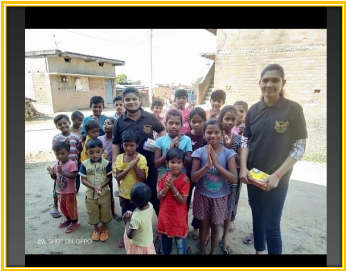
Inspiration to the rural students by College students