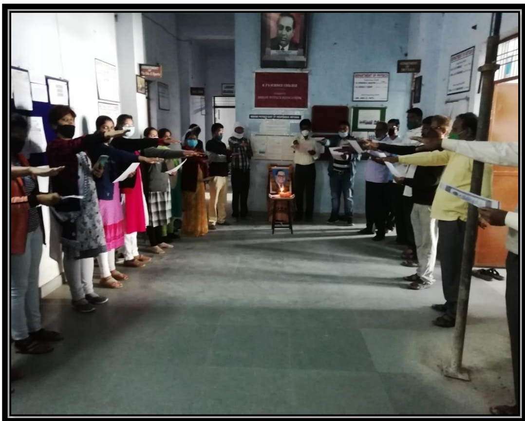
Staff and Students taking Oath on the occasion of "Samvidhan Diwas" at College