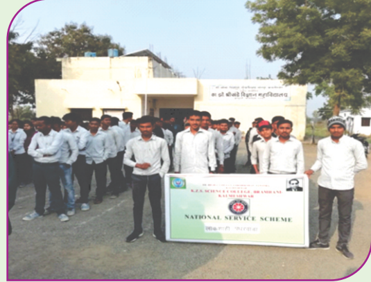
Lokshahi Pandharwada Rally