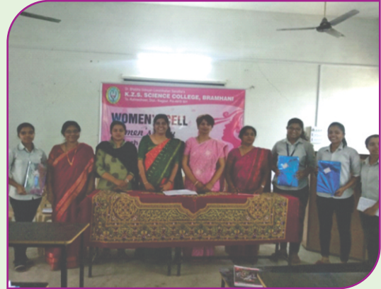
International women's Day celebrated by College Women Cell