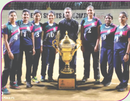
College Winning team "Khasdar Chashak"