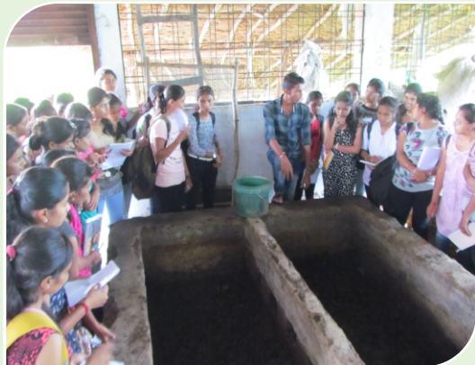
Visit to Kamdhenu Goshala, Deolapar