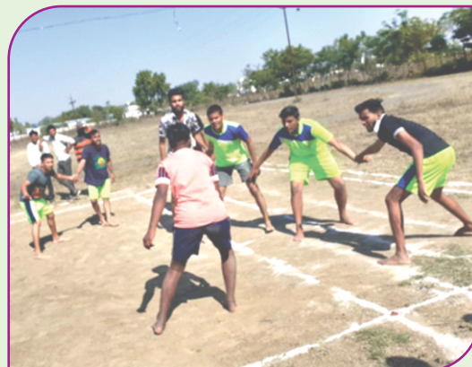
Kabaddi Competition organized by College Sports Dept.