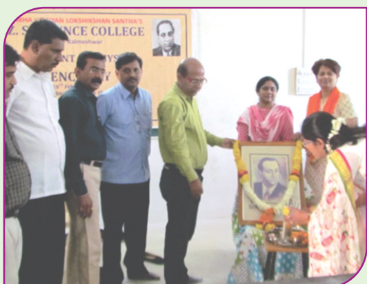
One day workshop on Solar energy by Physics Dept.