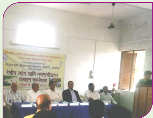
"Reshim Udyog ani Madhumashi palan" workshop Innougration Program