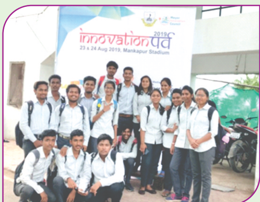
Participation of College students in "Innovation Parv" at Nagpur