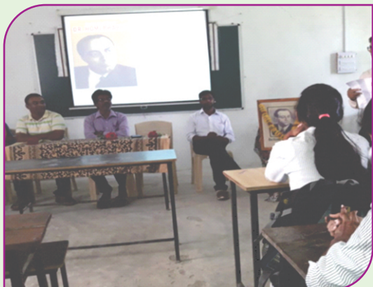
Dr. Homi Bhabha Jayanti celebration on the "Science Day"