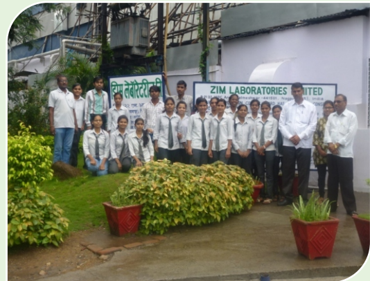
Study tour at Zim Laboratory