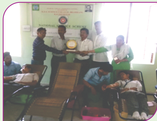
Blood donation camp was organized through NSS Unit at College