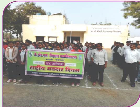
Rashtriya Matadar diwas rally for Matadan Janajagruiti