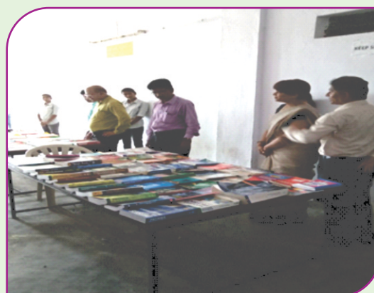
"Open bookstall" show organized by Library Dept.