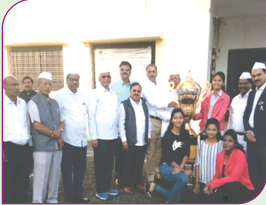
College Girls team won Khasdar Chashak, Nagpur