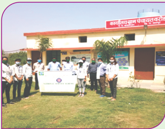
Distribution of Mask to Waroda Villegers by College team in Covid-19 Pandemic