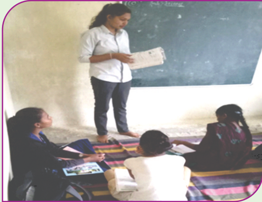
Doorstep education by College students at Wadar vasti near to waroda