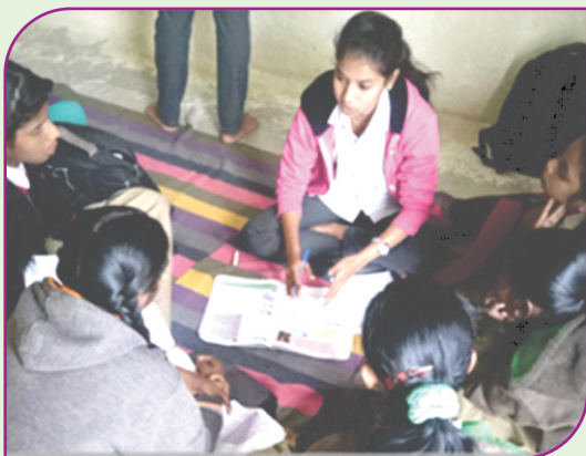
Doorstep education by College students at Wadar Vasti near to waroda