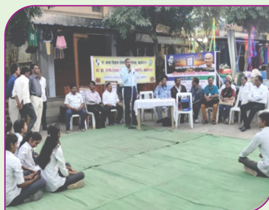
President of the Society addressing the gathering on the occasion of "samvidhan Bandhilaki Mahotsava"