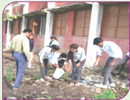
"Gram Swachchata" and "Plastic mukta Abhiyan" by College NSS team