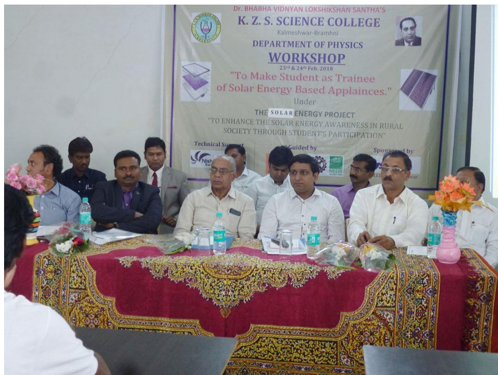
Inauguration ceremony of two days workshop on Solar energy by Physics department