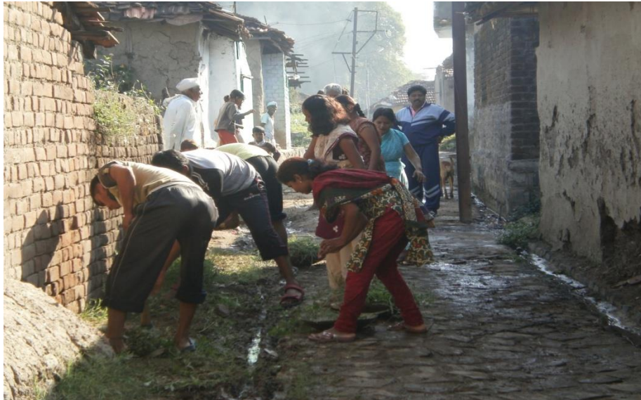
Sanitization Programme under NSS