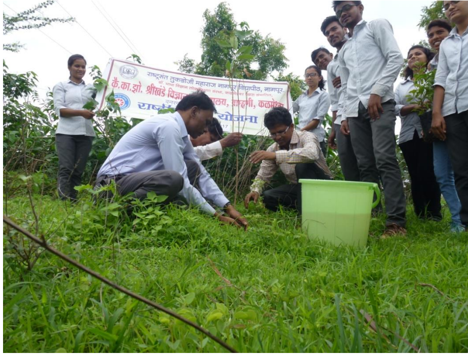
Plantation at college