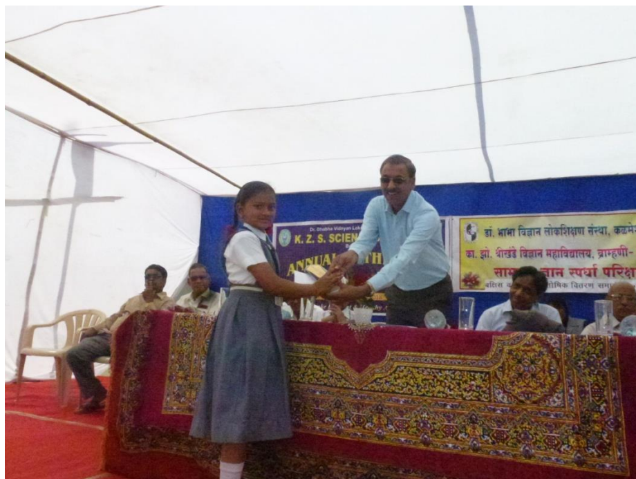
G. K. examination Prize distribution ceremony 2017