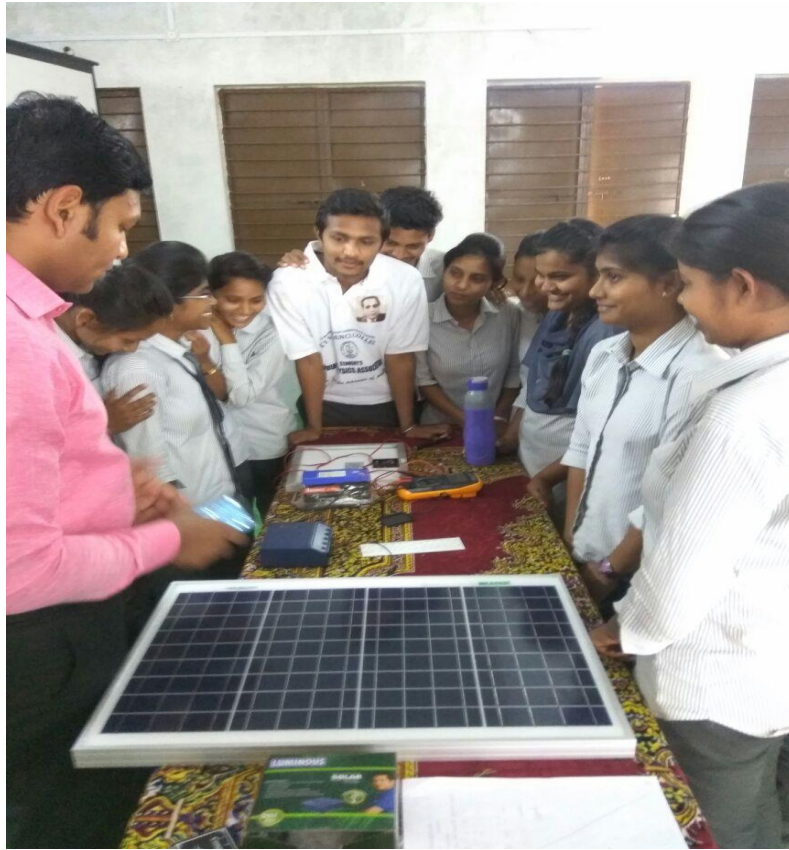
Students learning in Solar energy workshop