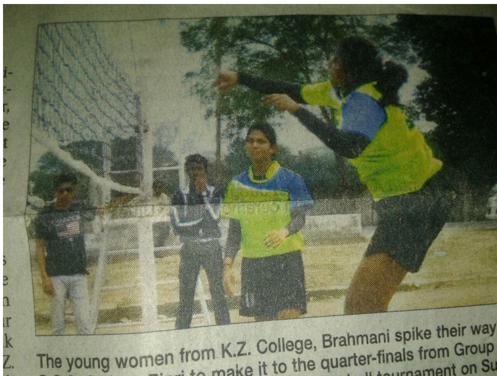
College students playing University Final Volleyball Vs Dr. Ambedkar College, Nagpur