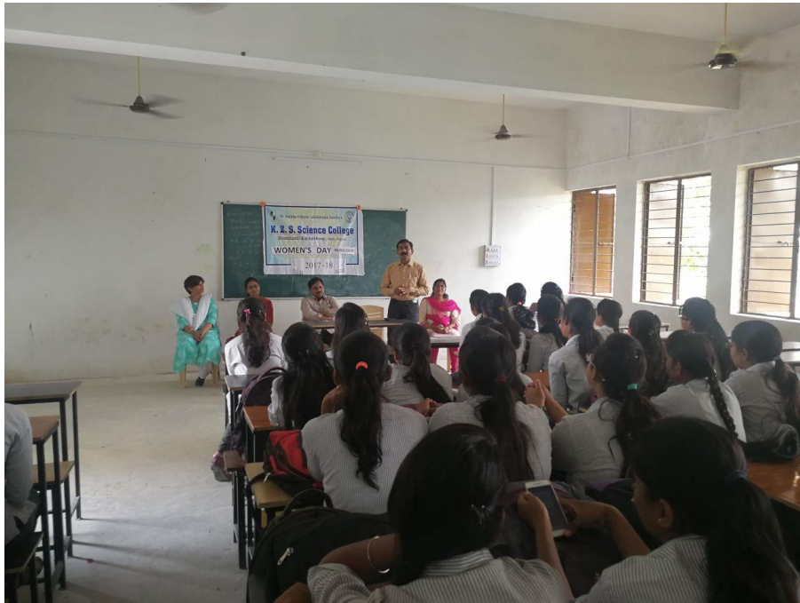
International Women's day Celebration