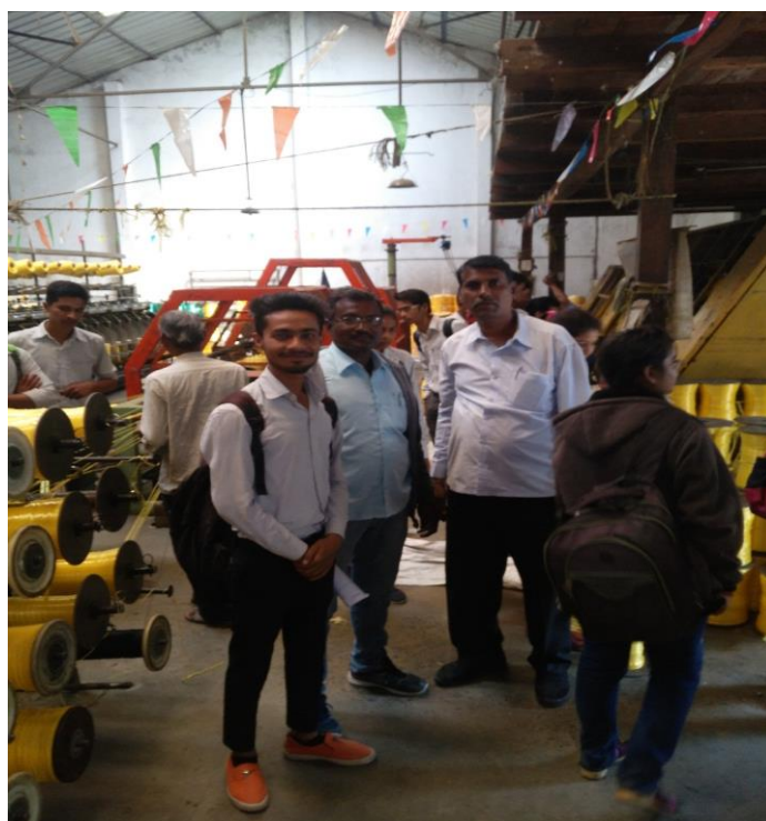
Industry visit by Chemistry department