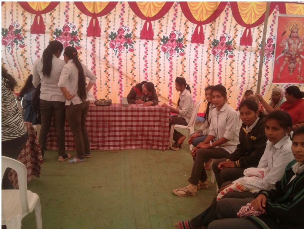
Blood donation camp