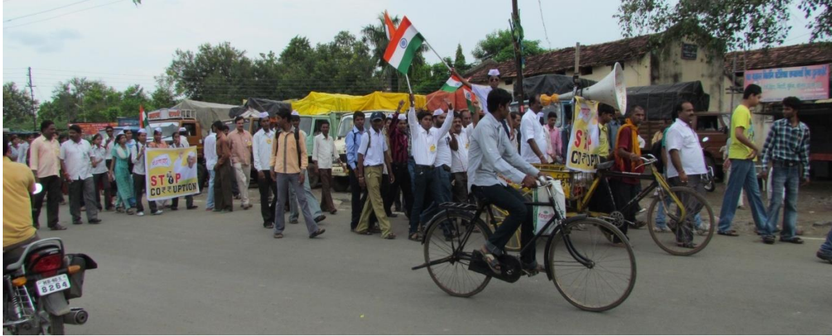
Rally against corruption in Kalmeshwar