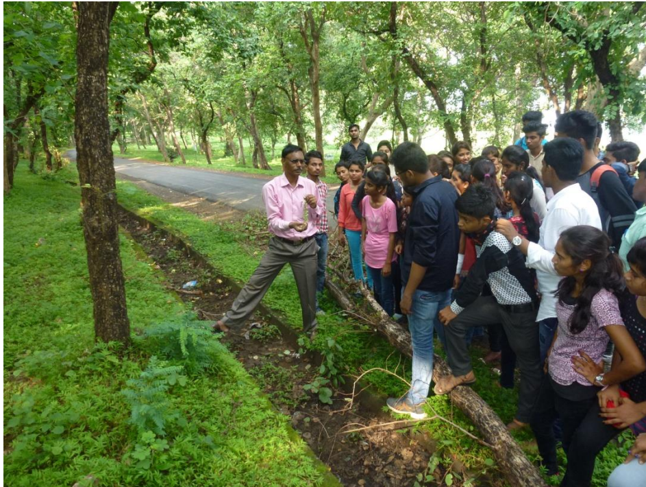
Study tour at Gosekhurd Dam by Botany and Zoology Departments