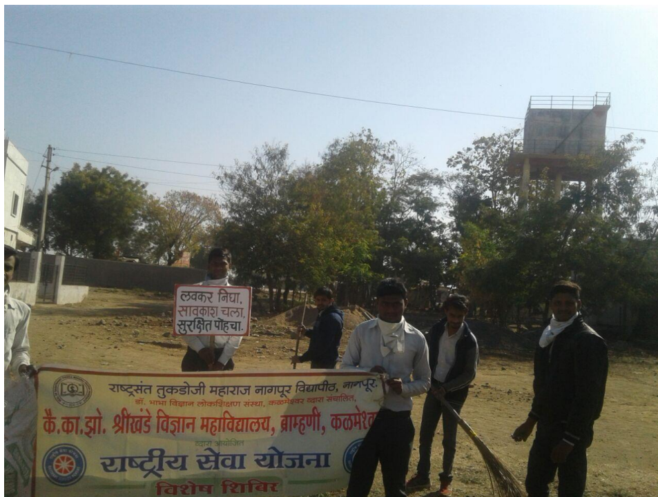
Special Camp on Swachhata Abhiyan by NSS at Bramhani Village