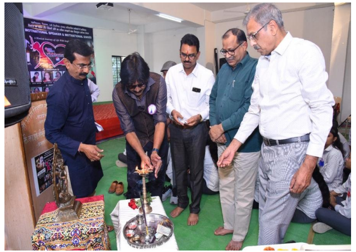
Motivational Show Inauguration