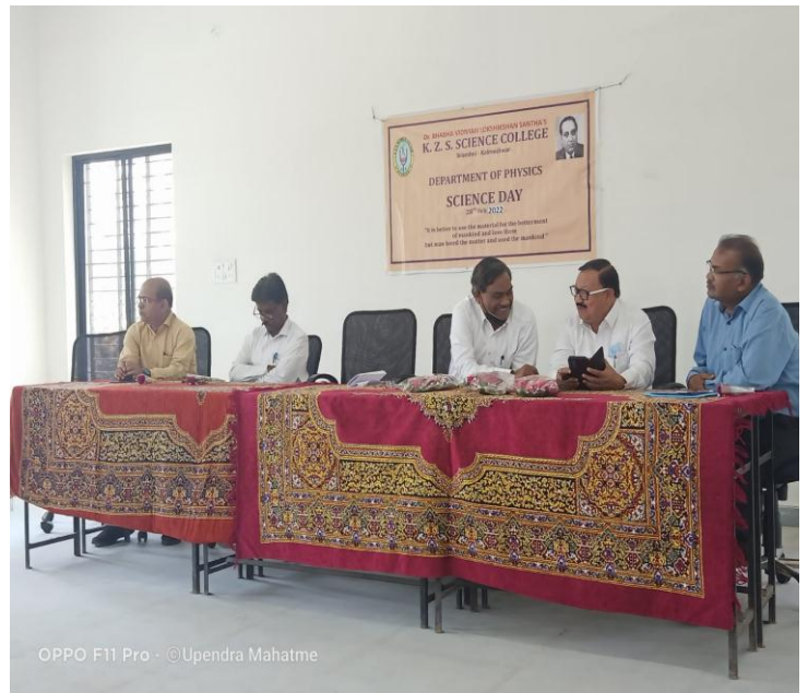
National Science Day