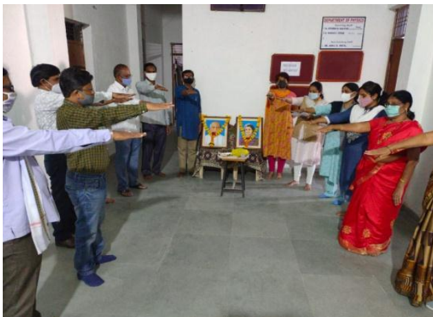
Rashtrya Samvidhan Diwas