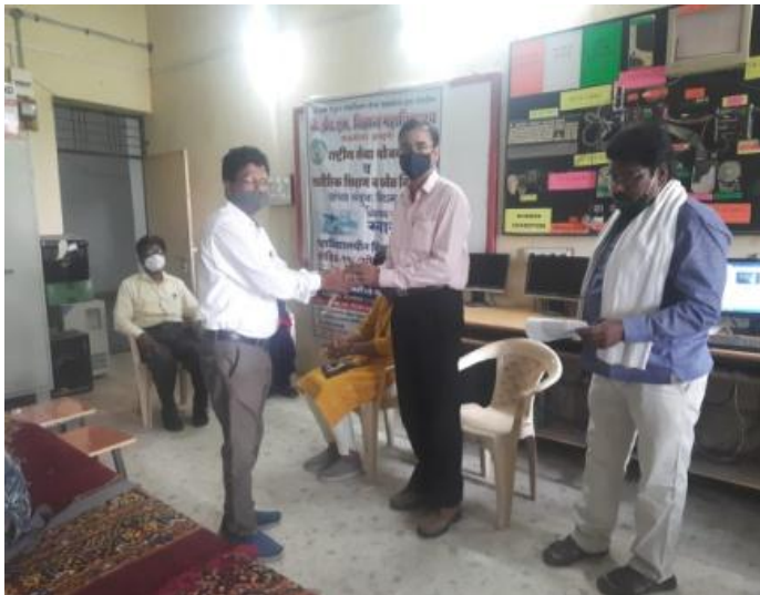
Students Vaccination Camp