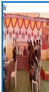
Health checkup Camp at Bramhani

Under the NSS unit of college , Health check up camp was organized at College for near by villager on the dated 2/2/2018. At this occasion number of participant took part in this camp.. For this work NSS volunteer and college staffa were worked.